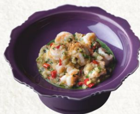
Goong Phad Mamuang Pakchi Pa Stir-fry prawns in mango and coriander ₹950