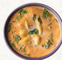
Keang Phed Mamuang Mango red curry Vegetables/Chicken/Prawns ₹550 / ₹650 / ₹850