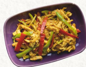
Gai Phad Prik Kamit Spicy turmeric chicken ₹550