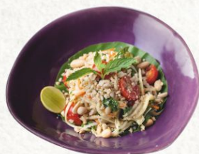
Yum Mamung Bot Mint and mango salad ₹280